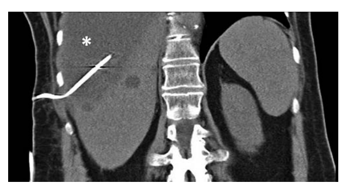
Fig. 3. Computed tomography demonstrating a large hepatic cyst in the right hepatic lobe (asterisk) with a pigtail drain inserted.

A 69-year-old female was referred to our clinic because a cardiological work-up for chest pain had led to the discovery of multiple hepatic cysts. Ultrasonography revealed a large cyst (21 cm) located in the right hepatic lobe. During AS, 3000 ml of clear, yellow fluid was drained. Seven weeks later, the patient complained of diarrhea (>10 times daily), nausea, and vomiting (> 5 times daily). Physical examination revealed right and left upper quadrant abdominal tenderness and a subfebrile body temperature (38.1°C). Laboratory investigations showed a highly increased serum CRP of 374 mg/L. To support the diagnosis of a cyst infection in this patient, the recently aspirated cyst was punctured with aspiration of pus. A pigtail drain (10.5 Fr) was inserted to allow complete drainage of the cyst during the following days (Fig. 3). Whereas blood cultures remained negative, cyst aspirate culture grew, Klebsiella pneumoniae confirming cyst infection diagnosis. Intravenous ceftriaxone/metronidazole was started. During the next week, serum CRP gradually decreased to 68 ml/L. The drain was removed and antibiotic therapy was switched to oral treatment with ciprofloxacin. After eight weeks of treatment symptoms resolved and serum CRP normalized.